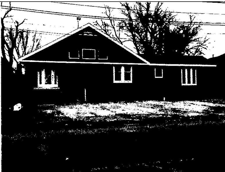
103 Adriatic Avenue, Front, 03/31/15

If using the Elevation Certificate to obtain NFIP flood insurance, affix at least 2 building photographs below according to the instructions for Item A6. Identify all photographs with date taken; "Front View" and "Rear View"; and, if required, "Right Side View" and "Left Side View." When applicable, photographs must show the foundation with representative examples of the flood openings or vents, as indicated in Section A8. If submitting more photographs than will fit on this page, use the Continuation Page.