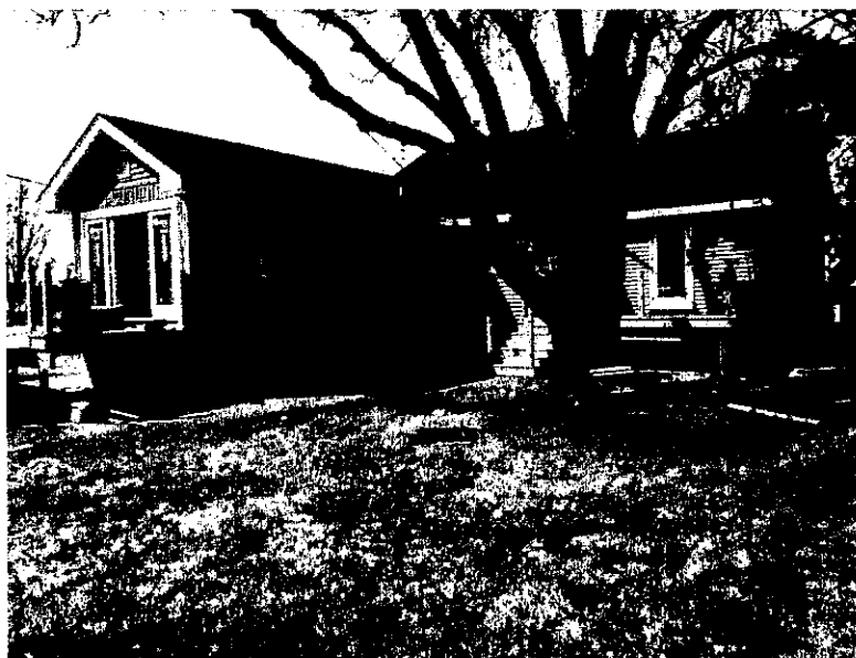
103 Adriatic Avenue, Rear, 03/31/15