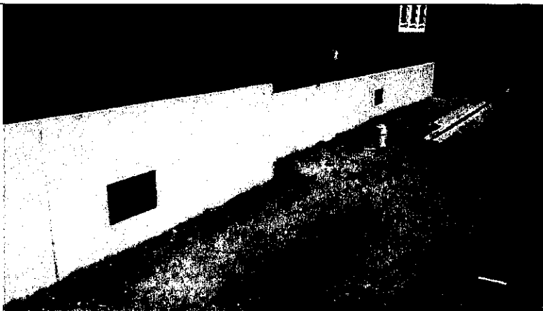
103 Adriatic Avenue, Smart Vent, 04/06/15

If submitting more photographs than will fit on the preceding page, affix the additional photographs below. Identify all photographs with: date taken; "Front View" and "Rear View"; and, if required, "Right Side View" and "Left Side View." When applicable, photographs must show the foundation with representative examples of the flood openings or vents, as indicated in Section A8.